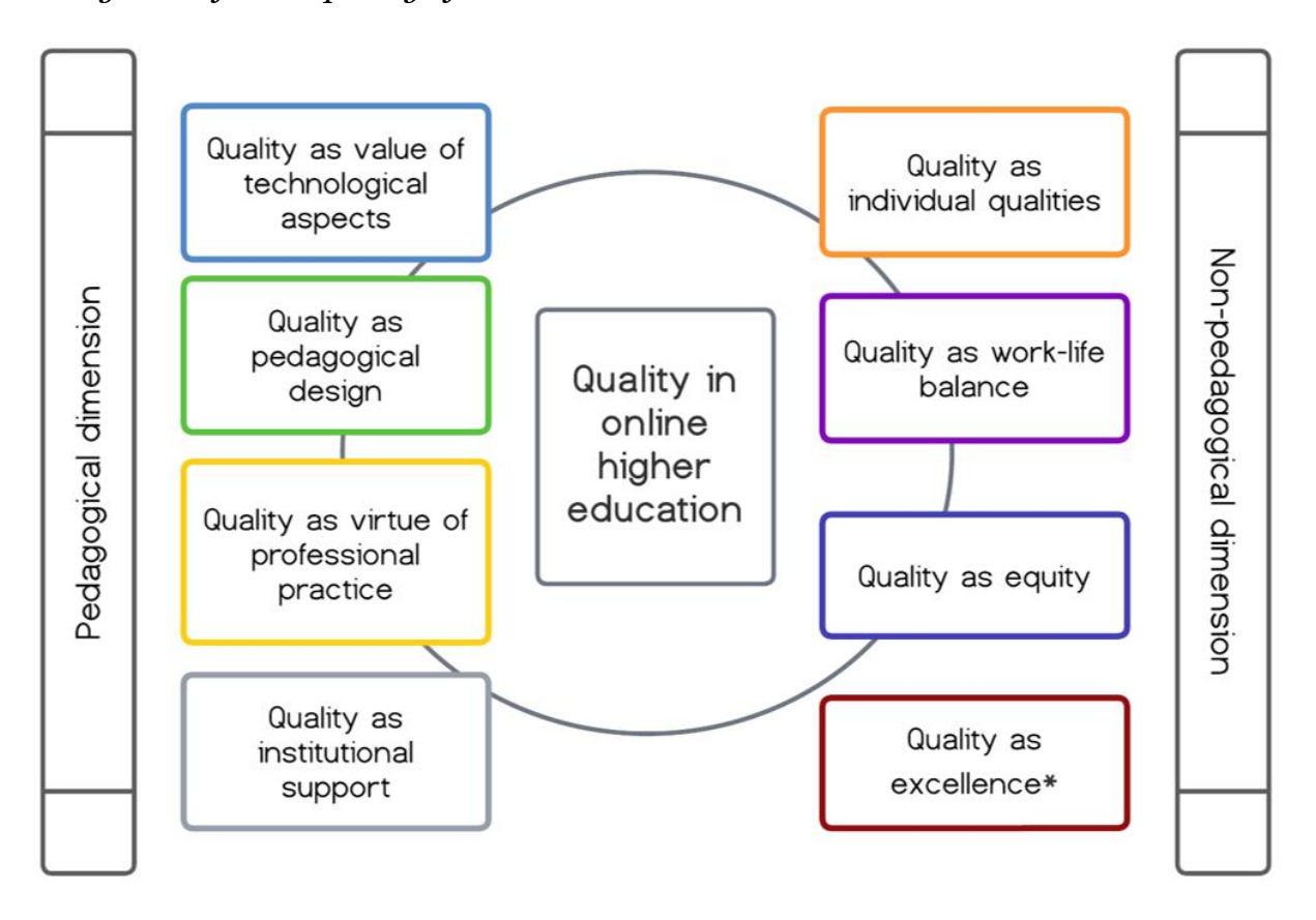
Figure 1 Categories of OHE quality of learners and teachers

*This category is the only one that is not emergent, as it corresponds to the conceptualization of Harvey and Green (1993).